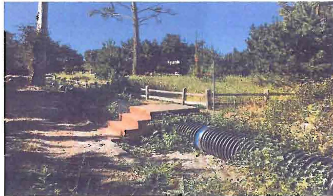
Steps over the new drainage pipes to the boardwalk below