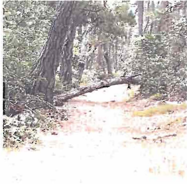
Bamboo Trail Equestrian Hazard