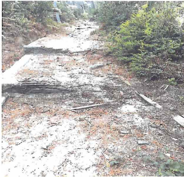
Replacement Beams ready for The Steps Trail repair