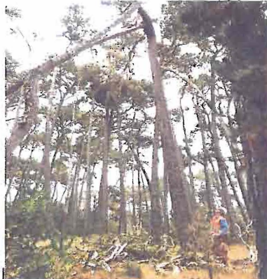
Serious Trail Hazard on Poppy