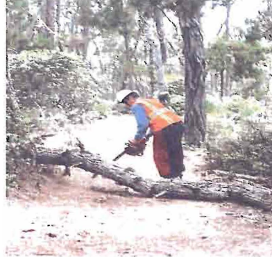
Bamboo Trail Hazard Removed