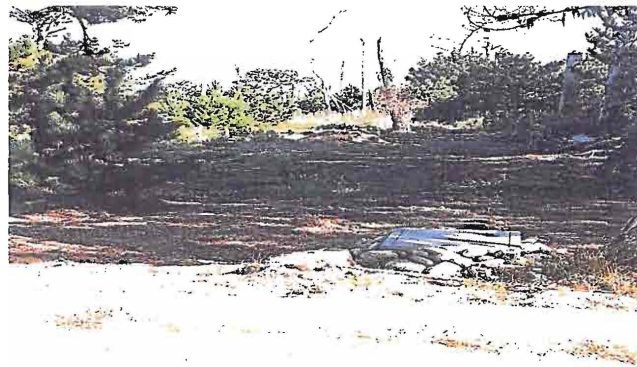
Cleared Red Trail around the GingerBread House – New Drainage