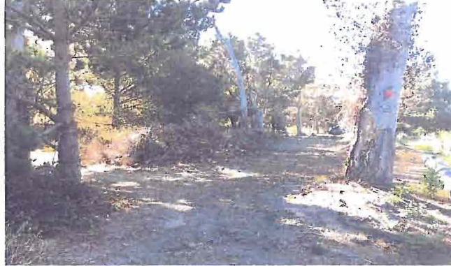
Lovely wide and cleared trails around the Conservancy Property