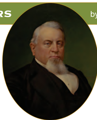
Railroad Baron Charles Crocker 1822-1888

Of the Big Four railroad barons (Huntington, Hopkins, Stanford and Crocker) only the Crocker family kept a presence in California. The family has been civic minded, socially active and extensively involved in various businesses. They also didn't mind putting on a great party. They built grand homes in San Francisco, Hillsborough, New York City and elsewhere, but their preferred seaside vacation homes were in Pebble Beach. When they came here they brought the cream of San Francisco society with them.