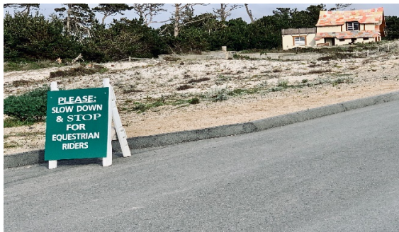
Sign on Dunes Road - 4/5