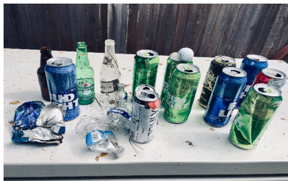
Alcohol Litter on +/- ¼ mile along Drake Rd