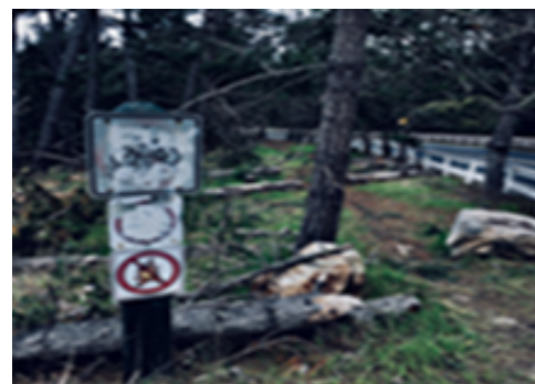
Defaced Bike and Smoking Signs (removed)