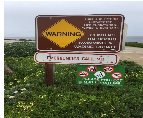
Standard Signs in Asilomar No signs in some areas between China Rock Seal beach