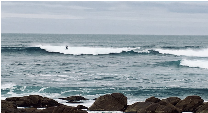
"Dumb as a rock award" in rough weather 4/7/19 "why we need to protect visitors from themselves"