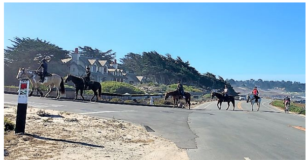
One area for a crossing sign on Green & Red Trails